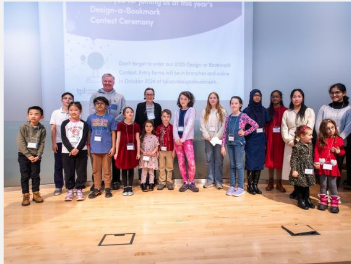
Toronto Public Library's 2024 Design-a-Bookmark contest at North York Central Library on March 2 nd .

Read more and register for summer camp and find a variety of arts courses and workshops and register.