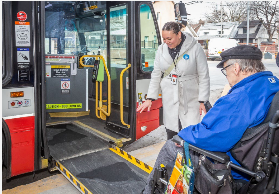
TTC's Wheel-Trans Community Feedback until April 30 th

You may also e-mail arjun.sahota@ttc.ca with the subject line "Subscribe – Line 3".