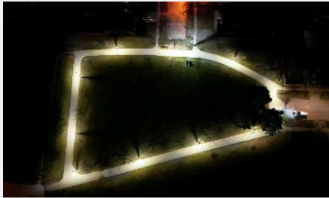
Sky view of Cornell Park Pathway Lighting